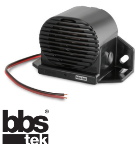
SA-BBS-97 - Self adjusting - medium duty - 77-97 Decibels