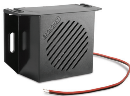
2 wire version shown

BC-01(H/Brake) - Single message - 2 wire - 90 Decibels BC-01(4W)(H/Brake) - Single message 4 wire - 90 Decibels