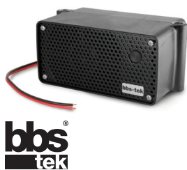
SA-BBS-107 - Self adjusting heavy duty - 87-107 Decibels