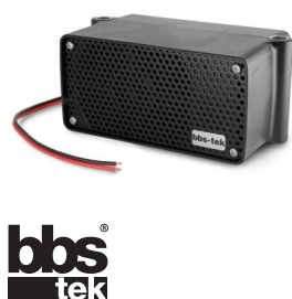
BBS-107 - Heavy duty - 107 Decibels